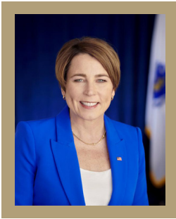
Maura Healey Massachusetts Governor

The Massachusetts Export Center is committed to helping the state's businesses succeed in today's global marketplace.