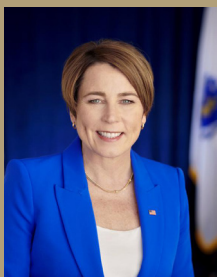
Maura Healey Massachusetts Governor

The Massachusetts Export Center is committed to helping the state's businesses succeed in today's global marketplace.