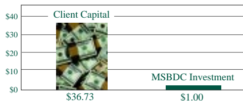
Return on Investment Return of $11.33 in state tax revenue for every state dollar expended on the MSBDC program